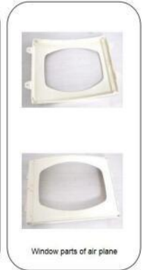
Window parts of air plane