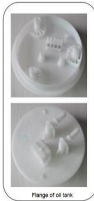
Flange of oil tank