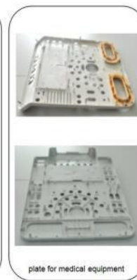
plate for medical equipment