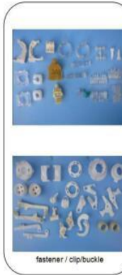
fastener / clip/buckle