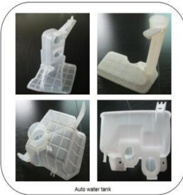
Auto water tank