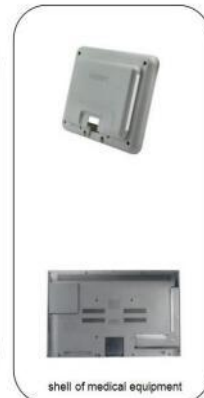
shell of medical equipment