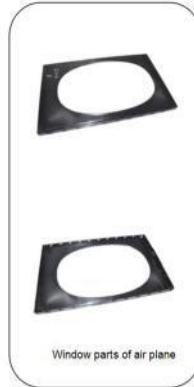
Window parts of air plane