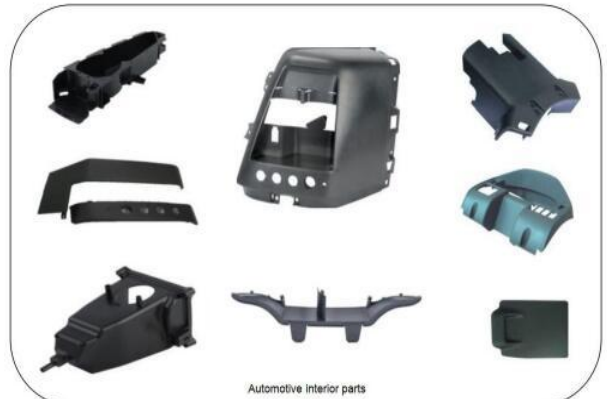
Automotive interior parts