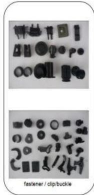
fastener / clip/buckle